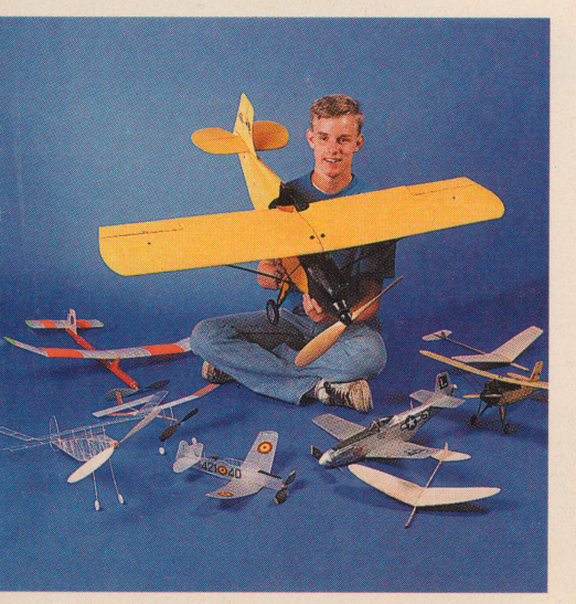
Model airplanes come in all sizes.