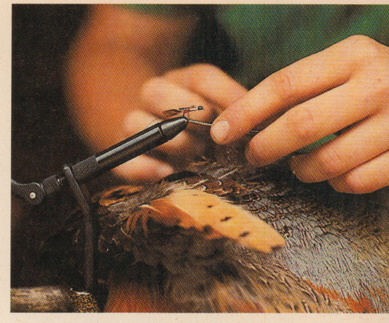
Fishing is a popular hobby. Save money by tying your own flies.

Look for hobbyists among the troop's merit badge counselors. Many of the Boy Scouts of America's more than 100 merit