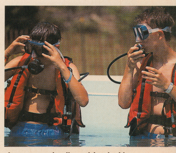
Learn to scuba dive with a buddy and discover a whole new world underwater.