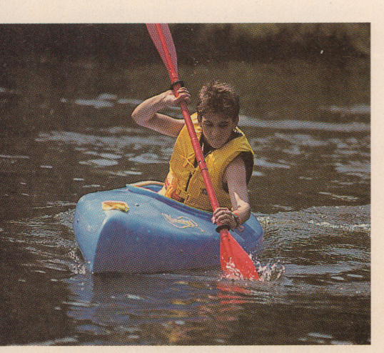
Sports like kayaking are hobbies too.

Hobbies A Plant's Hobbies Hobbies Hobbies Hobbies Hobbies Hobbies Hobbies