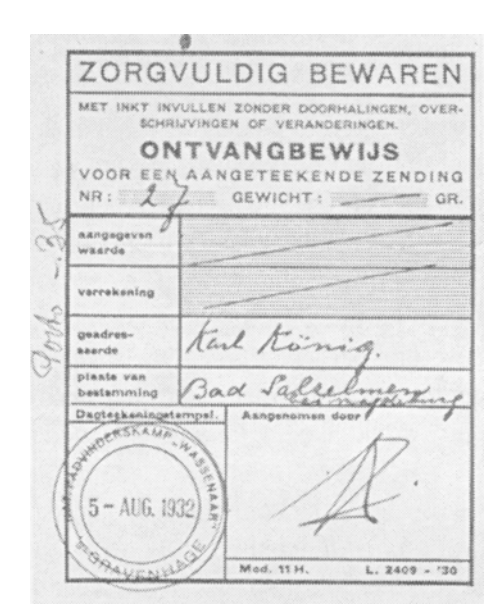
A postal receipt validated with the special Scout cancel from the 1932 National Scout Camp in the Netherlands. An interesting example of philatelic peripherals

A collector could just collect the perforate variety of the stamps without the imperforate types, souvenir sheets and all the rest