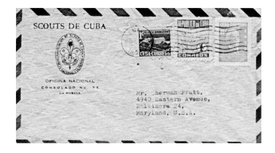
A Cuban Scout 'Corner Card' from the National Council. A nice example of the type, interesting and inexpensive as well!

on them from both within the Scouting organizations and from business and industries that have supported Scouting throughout the years. These come from all over the nations of the world were the Scouting is present. Many of them difficult to find for most are on ordinary business type mail that collectors do not see and are thrown away. The Journal now has a monthly column devoted on this under studied area of collecting. This could be a real hunt for the elusive and yet not expensive items to collect in most cases.